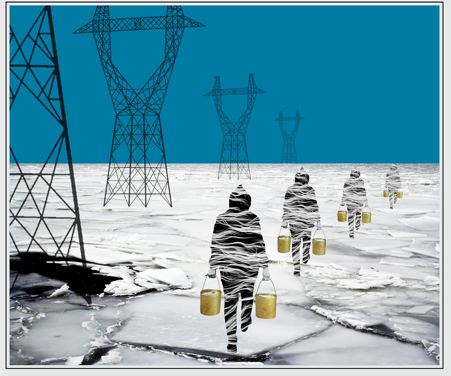
VIII of CUPS.